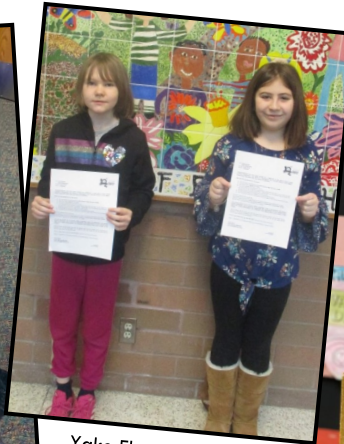
Yake Elementary 2020 Sodexo's Future Chefs Competition finalists.