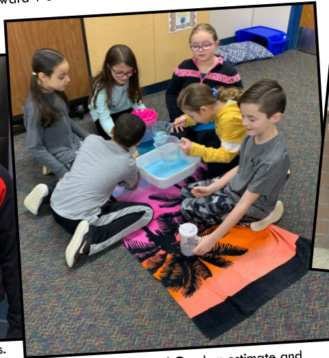
Skyhawk Third Graders estimate and measure liquid volume.