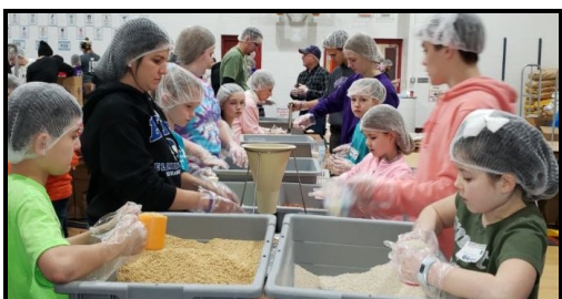
Erving Elementary students.

Thank you to all who participated and teaching our students the important of helping those in need.