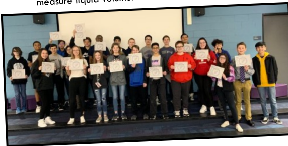
PHMS January Students of the Month