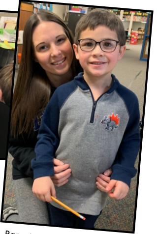
Parent volunteers are the best!