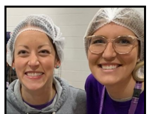
Wegienka Elementary teachers lend a hand.