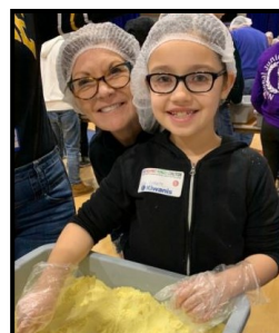
Erving Elementary helpers.