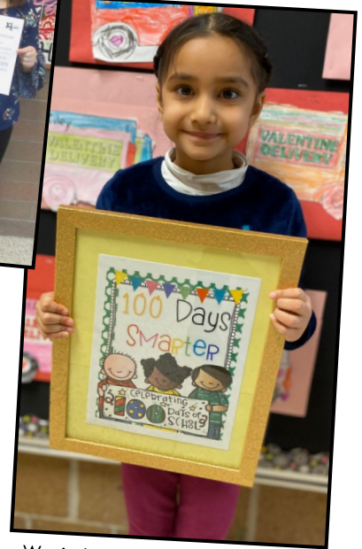
Wegienka Elementary Kindergartners are 100 days smarter!