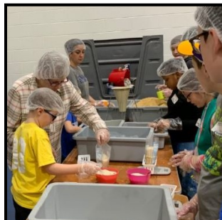
Wegienka Elementary students.