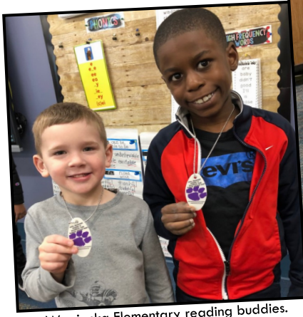
Wegienka Elementary reading buddies.