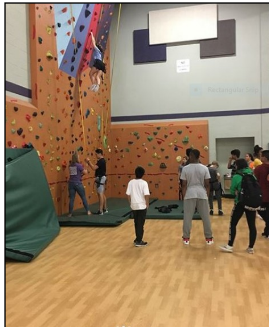
On the wall at PHMS.