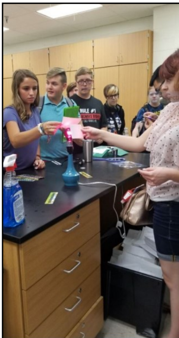
Learning about chemistry.