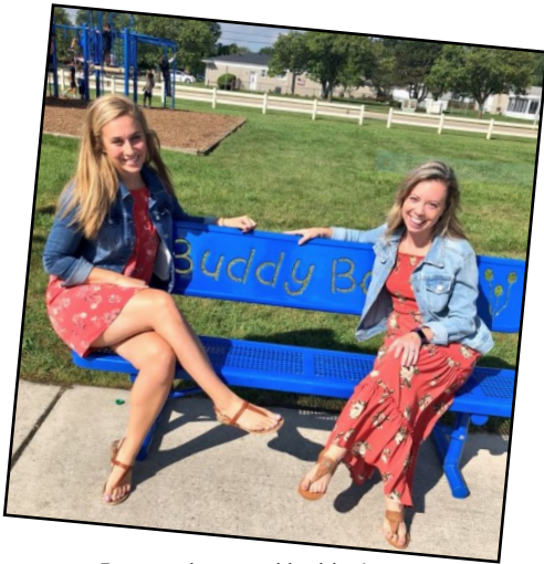
Even teachers need buddies!